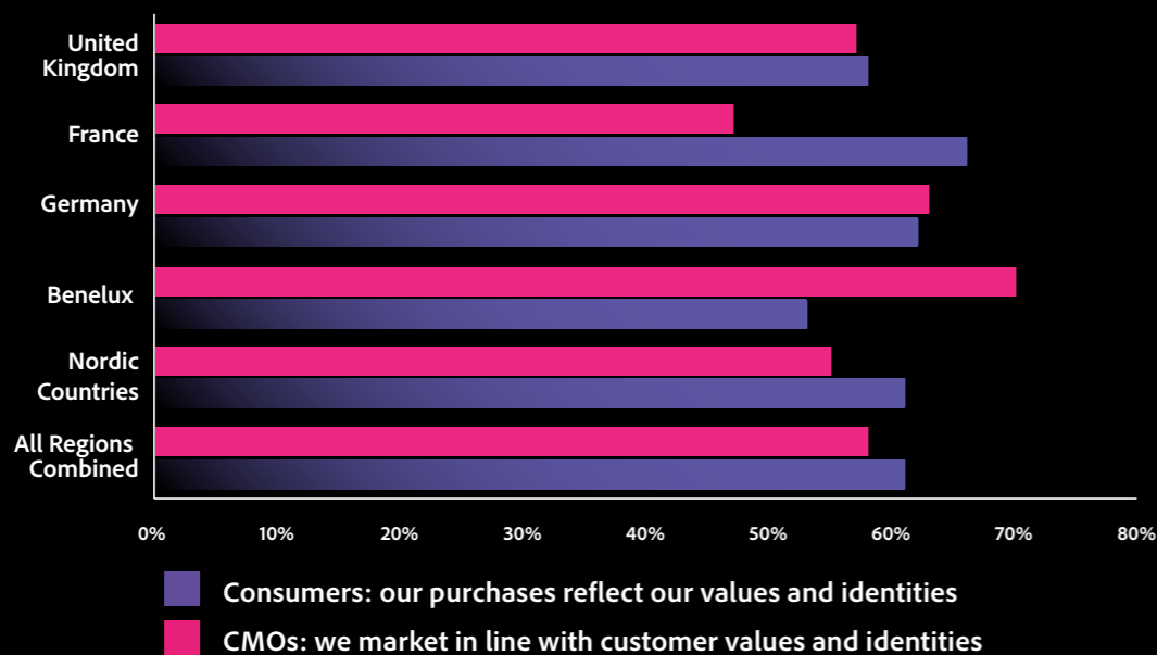
Geographical breakdown of consumers vs CMOs on meeting the needs of the Changing Consumer