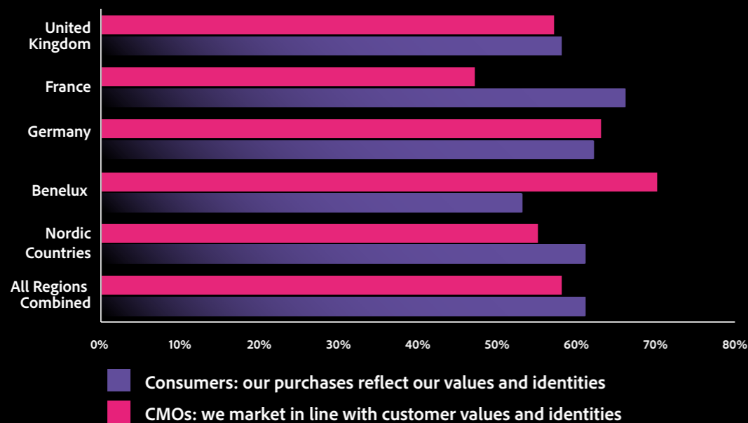
Geographical breakdown of consumers vs CMOs on meeting the needs of the Changing Consumer